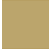
Copper - COP