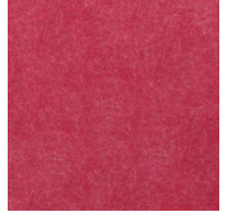
Fuchsia - FUA