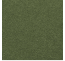
Seaweed - SWD