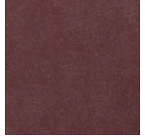
Merlot - MER