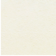
Eggshell - EGG