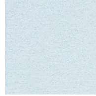
Frost - FST