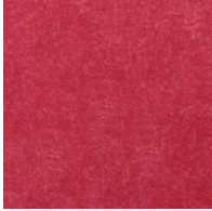
Poppy - PPY