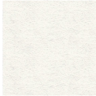
Polar - POL