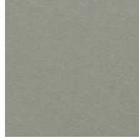
Fossil - FOS