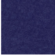
Royal - ROY