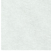
Fog - FOG