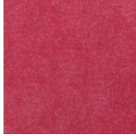
Fuchsia - FUA