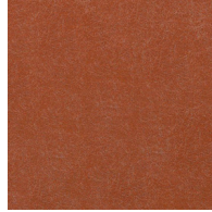
Rust - RST