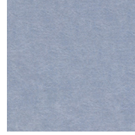
Breeze - BZE