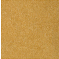
Mustard - MUS