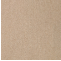
Khaki - KHA