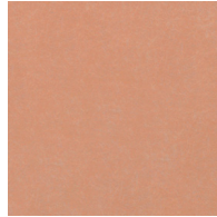
Peach - PEA