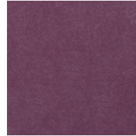
Plum - PLU