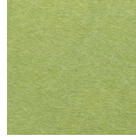
Lime - LIM