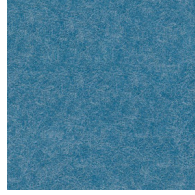
Baltic - BTC