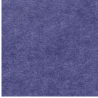
Iris - IRI