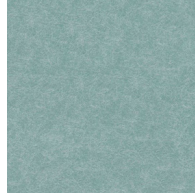
Lichen - LIC