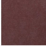
Merlot - MER