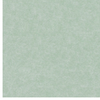
Celadon - CEL