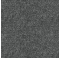
Iron - IRO