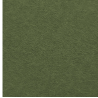
Seaweed - SWD