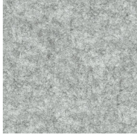
Ash - ASH