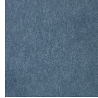
Steel - STE