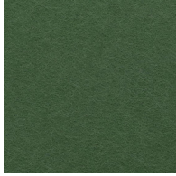
Evergreen - EVG