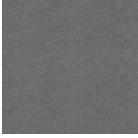
Anchor - ANC