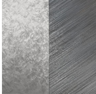
Silver Powder/Brushed Iron - SPI