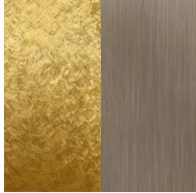
Gold Powder/Brushed Bronze - GPB