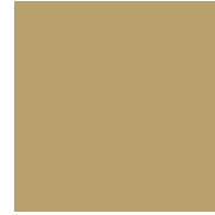
Brass - BRA