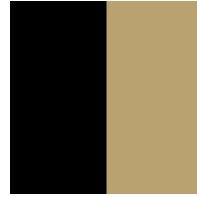
Black/Brass - BKB