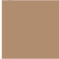
Beige - BEI