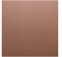
Satin Copper - SCO