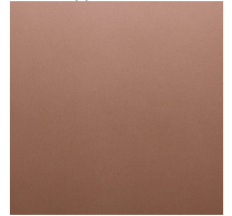
Satin Copper - SCO