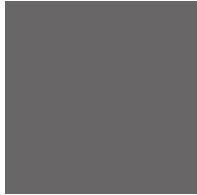
Metallic Anthracite - MAN