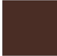
Coffee - COF