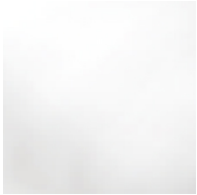
Embossed White - EWH