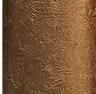
Bronze Leaf - BRL