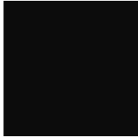
Embossed Black - EBK