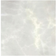
White Alabaster - WHA