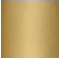
Pewter - PWT