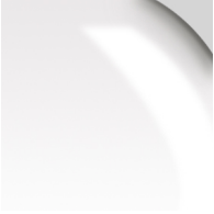
Transparent - TRA