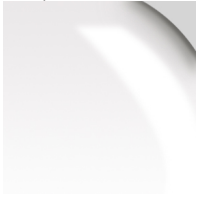
Transparent - TRA