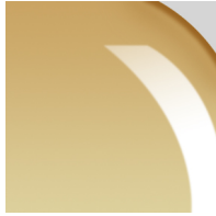
Amber - AMB