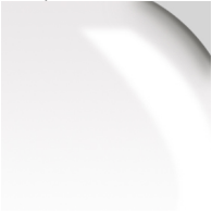
Transparent - TRA