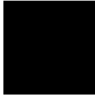
Matte White - MWH