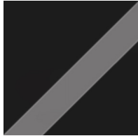
Black Chrome - BCH