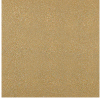
Jazz Gold - 29