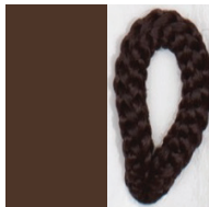
MARRON Pant. 476C 187