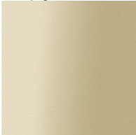
Champagne - CHA