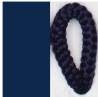
PACIFIC Pant. 2767C 68