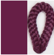
RUBINA Pant. 229C 285