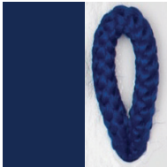
MEDAS Pant. 295C 24