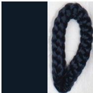
NOCTURNO Pant. 7547C 66