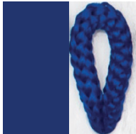
AZUL ROYAL Pant. 288C 1075