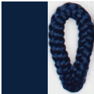
MARINO Pant. 289C 63