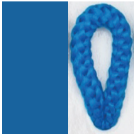
TEJANO Pant. 3015C 55