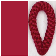
SATAN Pant. 207C 19