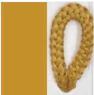
S - MUSTARD Pant. 1245C 168