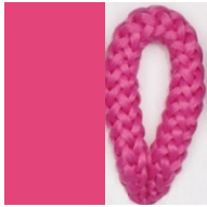
CICLAMOR Pant. 205C 264