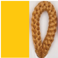
AMARILLO Pant. 109U 1