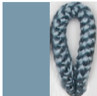
LITIO* Pant. 5425C 2621