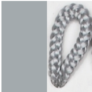
ALPACA Pant. 429C 1401