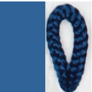
S - BLUE (INDIGO) Pant. 653C 61