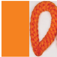
LAVA Pant. 151C 1334