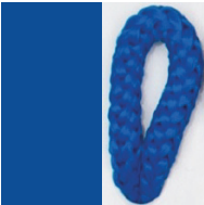
AZUL ELECTRICO Pant. 2945 49