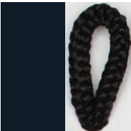
BOREAL Pant. 7547C 1786