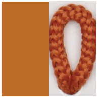
S - TERRACOTTA Pant. 153C 205