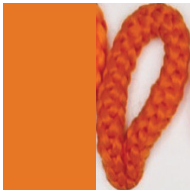
CALABAZA Pant. 158C 84