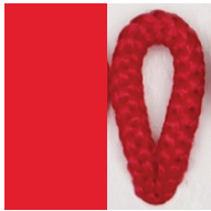
FUEGO Pant. 185C 245