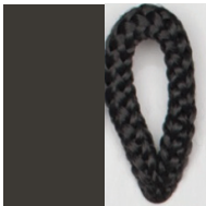
TUNEL Pant. BLACK 7C 169