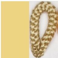
GOLDEN Pant. 7403C 7