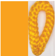
NECTAR Pant. 137C 1871