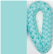
LAGO Pant. 324C 313