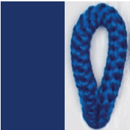
OCEANO Pant. 294C 67