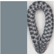
DELHIN Pant. 430C 126