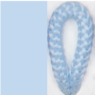
ESCARCHA Pant. 2707C 60