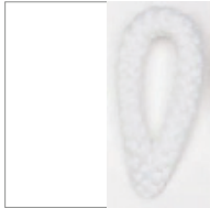
S - WHITE- WHI Pant. WHITE 71