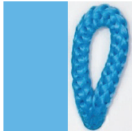
BLAVINA Pant. 2915C 59