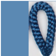
ALITALIA Pant. 646C 125