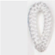
CRYSTAL Pant. GLASS 75