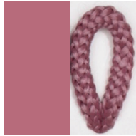
FRESILLA Pant. 695C 273