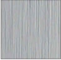
Natural anodized - ANA

Digital: Not all screens are calibrated the same, and therefore, colors will appear differently between screens.