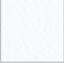
Snowfall White - 44 (SFW)