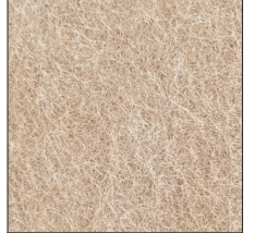
Amber Earth - 55 (ARE)