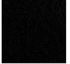
Twilight Navy - 69 (TTN)