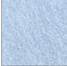
Cloudy Blue - 73 (CYB)