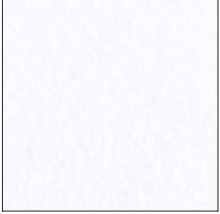
Snowfall White - 44 (SFW)