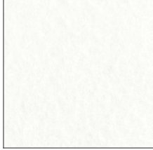
Creamy White - 97 (CW)