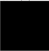
Black - BLK (BLK)

Digital: Not all screens are calibrated the same, and therefore, colors will appear differently between screens. Physical: When texture is involved, there will be variations in color, character and tone within a product series and between product families. Gun Metal: No Gun Metal finish is alike. It combines a mixture of transparent and black color particles which ensures a highly individual effect and no luminaire being identical. Champagne Cream, Copper Mine, Ancient Bronze + Jazz Gold: These finishes have slight fading from specific powder coating production. Each luminaire will slightly vary.