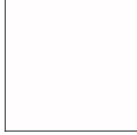
Crystal White - 03 (CWI)