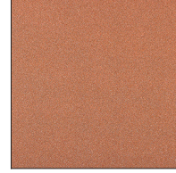
Copper Mine - 27 (COM)