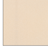
Hampton Bay - 05 (HAB)