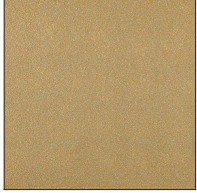
Jazz Gold - 29 (JAG)