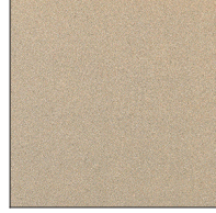
Champagne Cream - 26 (CHC)