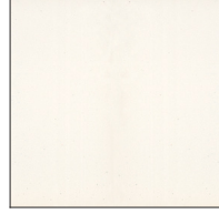
Creamy - 04 (CRY)