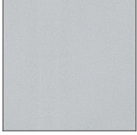
Sparkling Silver - 01 (SSR)