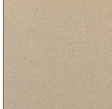
Champagne Cream - 26 (CHC)