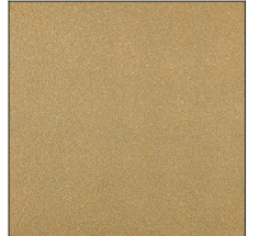
Jazz Gold - 29 (JAG)