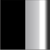
Black/Polished Aluminum - BPA

Digital: Not all screens are calibrated the same, and therefore, colors will appear differently between screens. Physical: When texture is involved, there will be variations in color, character and tone within a product series and between product families.