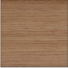
Oak - OAK

Digital: Not all screens are calibrated the same, and therefore, colors will appear differently between screens.