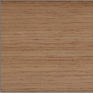
Oak - OAK

Digital: Not all screens are calibrated the same, and therefore, colors will appear differently between screens. Physical: When texture is involved, there will be variations in color, character and tone within a product series and between product families.