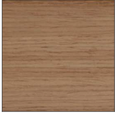
Oak - OAK

Digital: Not all screens are calibrated the same, and therefore, colors will appear differently between screens.