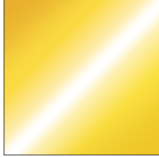
Shiny Gold - GLD