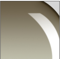
Tobacco - TOB