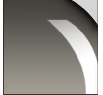
Tobacco - TOB