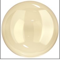
Amber - AMB