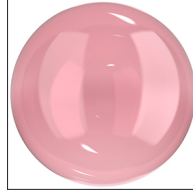
Ruby - RUB