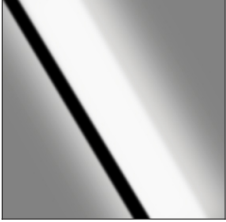
Polished Stainless Steel - PSS

Digital: Not all screens are calibrated the same, and therefore, colors will appear differently between screens.