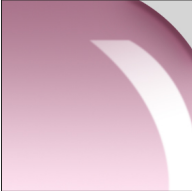
Pink - PNK