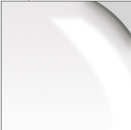
Transparent - TRA