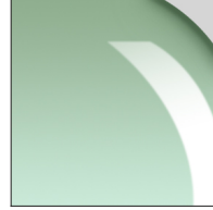
Green - GRN