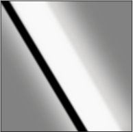
Polished Stainless Steel - PSS

Digital: Not all screens are calibrated the same, and therefore, colors will appear differently between screens.