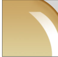
Amber - AMB