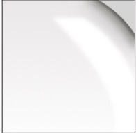
Transparent - TRA