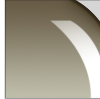
Tobacco - TOB