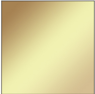
Brushed Brass - BBS