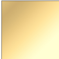
Satin Gold - SGD