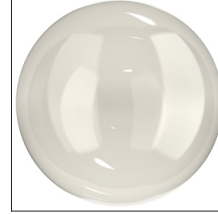
Tobacco - TOB