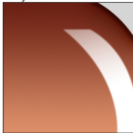
Ruby - RUB