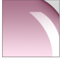
Pink - PNK