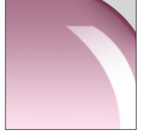
Pink - PNK