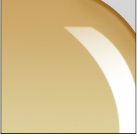
Amber - AMB