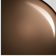
Bronze - BRZ