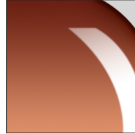
Ruby - RUB