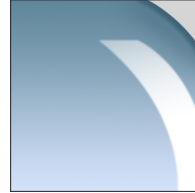
Sky Blue - SKB