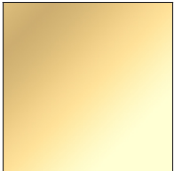
Satin Gold - SGD