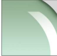
Green - GRN