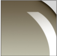
Tobacco - TOB