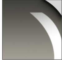
Smoke - SMK