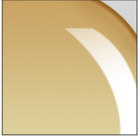
Amber - AMB