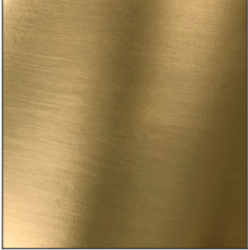
Satin Gold - SGD