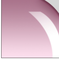
Pink - PNK