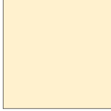
Champagne - CHA