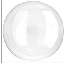
Transparent - TRA