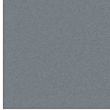
Gray - GRY