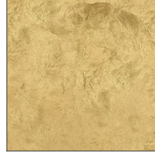
Gold Leaf - GLF