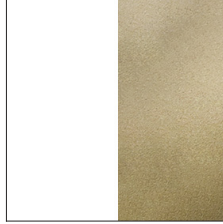
White/Gold Silver - WGS